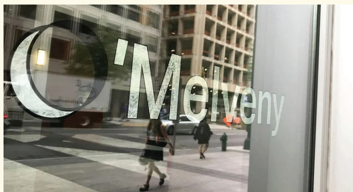
O'Melveny offices in Washington, D.C.

The Texas lawyers—who came from firms including Baker Botts, Locke Lord, Norton Rose Fulbright and Thompson